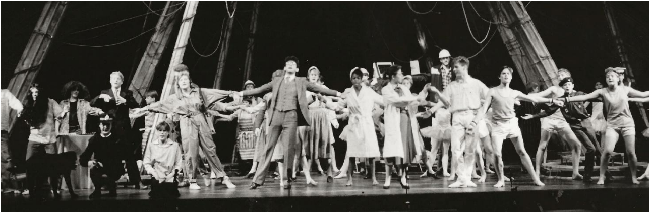
The NYMT cast of 1987 at the premiere of the show.